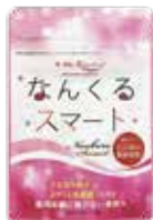
Nankuru Smart 2,500yen(excluding tax) / 45 capsules